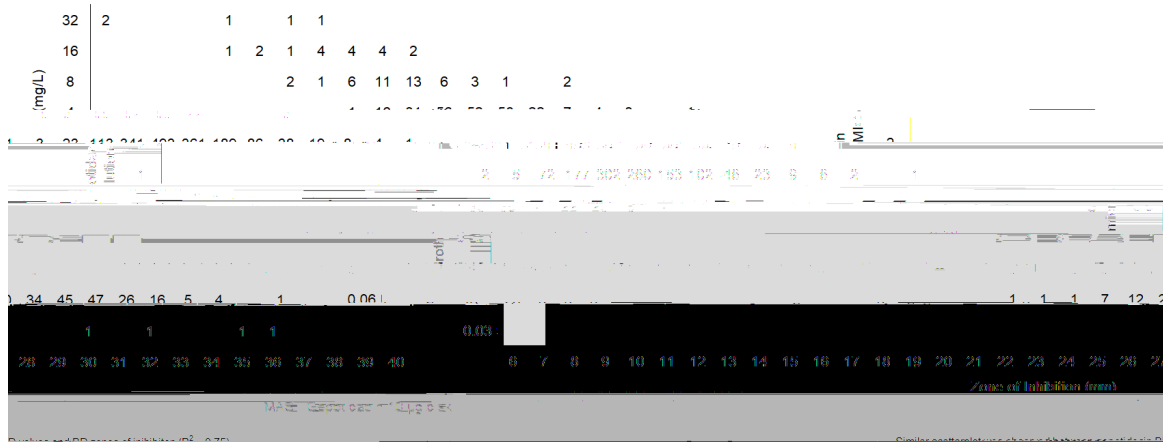
Figure 2. Gepotidacin broth microdilution MICs vs MAST disk diffusion zones of inhibition for all isolates - E. coli (n = 3,379) and S. saprophyticus (n = 264)

The two gepotidacin commercial disks performed similarly, with 99.2% agreement ( \pm 3 mm) between zone diameter values and an R^2 = 0.94 .